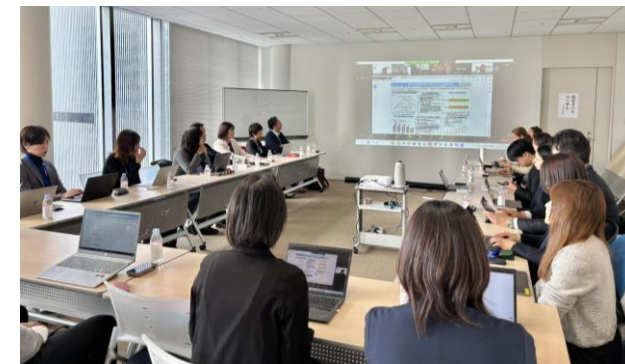
▲Discussions in the Community (Jan. 2025)