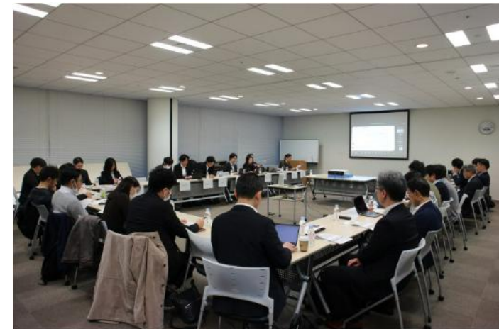
▲ Discussions in the Community (Nov. 2023)