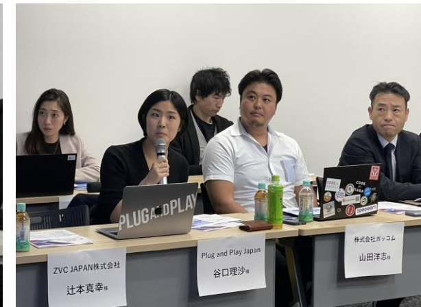
▲ Discussions in the WG (December 2023)