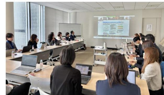
▲Discussions in the Community (Jan. 2025)