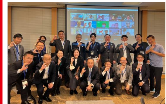
▲Carbon Neutral WG Phase 2 Members

2023/4/27 Released JANE Carbon Neutral Vision , as an outcome of the year-long discussions in the WG.