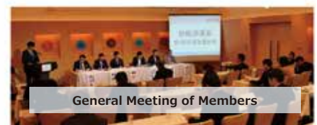
General Meeting of Members

*Titles and positions are as of the date of the events