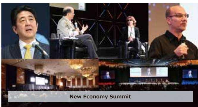
New Economy Summit