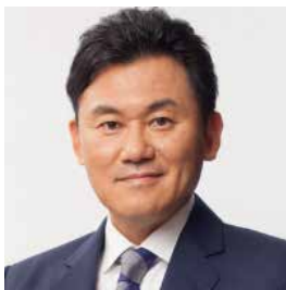
Representative Director Hiroshi Mikitani Chairman & CEO Rakuten Inc.