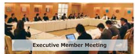
Executive Member Meeting