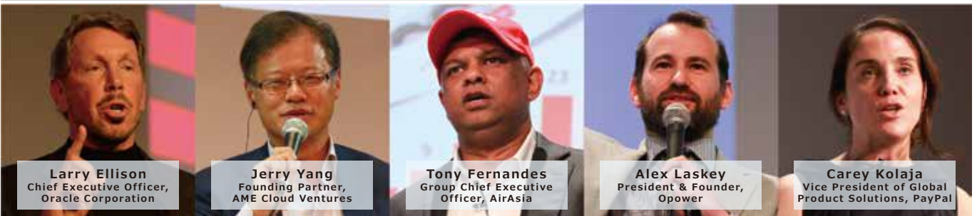
Larry Ellison Chief Executive Officer, Oracle Corporation