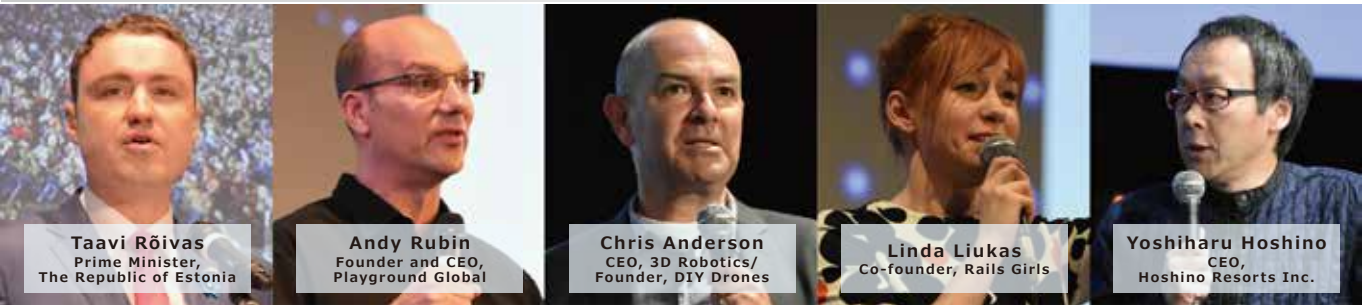
Taavi Rõivas Prime Minister, The Republic of Estonia