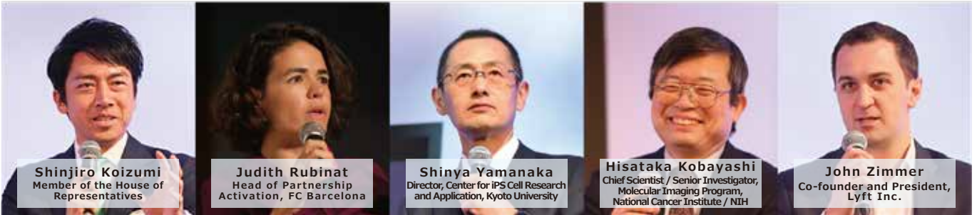
Shinjiro Koizumi Member of the House of Representatives