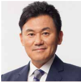
Representative Director Hiroshi Mikitani Chairman & CEO Rakuten Inc.