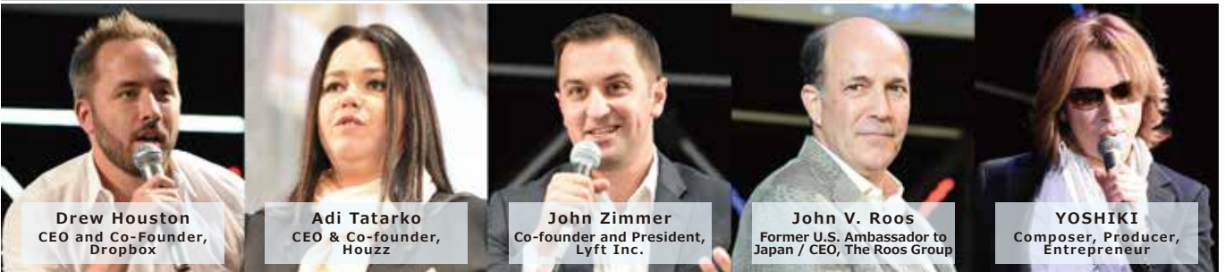
Drew Houston CEO and Co-Founder, Dropbox