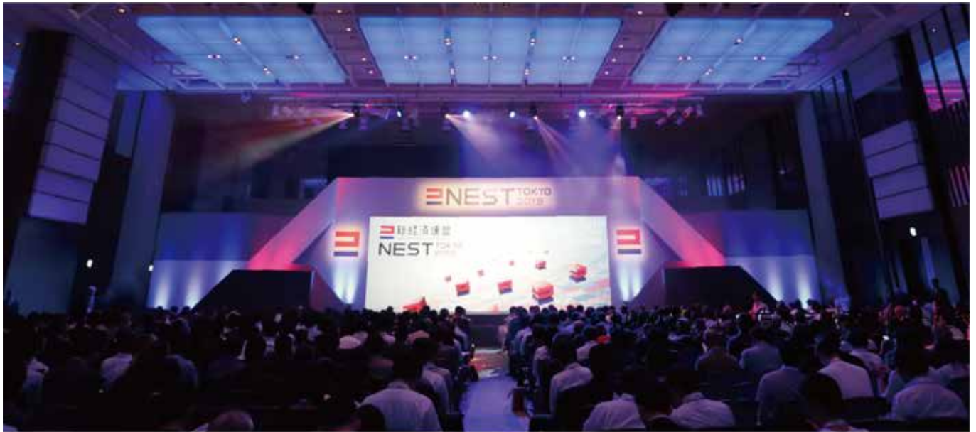
JANE hold "New Economy Summit (NEST TOKYO 2019)" on June 20, 2019. The 7th NEST had the panel sessions of front-runners in timely topics such as 5G, eSports, Ai x Medicine, and Digital First Law. More than 1,000 people attended this event.